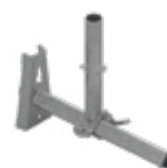
Facade holder EPS-USP 3,9 kg