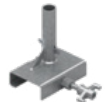
Girder holder EPS-UDZ-V2 3,4 kg