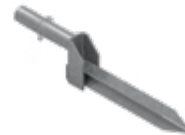
Drop-in holder EPS-UW-V3 2,4 kg