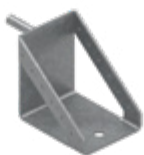
Working platform holder EPS-UPR 1,8 kg