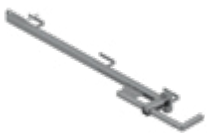
Bracket clamp with post EPS-UUS 7,2 kg