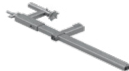
Clamping holder L800 EPS-UUN800-V2 8,5 kg